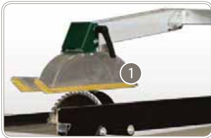
We lay great stress on your safety. That is why the SUVA guard is included when you buy Logosol PS315.

An extremely stable dimensioning saw with high precision and capacity.