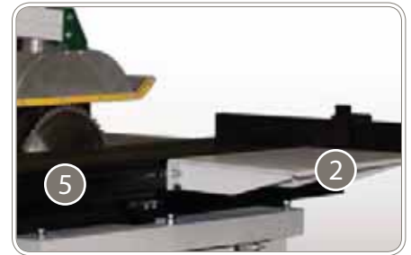
The saw comes completely equipped with a universal saw blade of 315 mm and an extension table for the sliding table.

The dimension saw PS315 comes completely equipped with a universal saw blade of 315 mm, a stable SUVA guard for the saw blade, an extension table for the sliding table and the out-feed table. There is a chip extractor connection under the saw blade, and also the blade guard can be connected to a chip extractor. As accessories there are additional extension tables for the sliding table, clamping devices and saw blades suitable for different purposes.